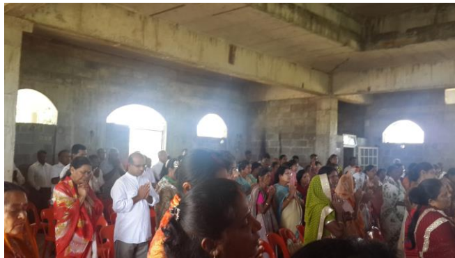
Figure 2: Doorga Pooja Oct 2015