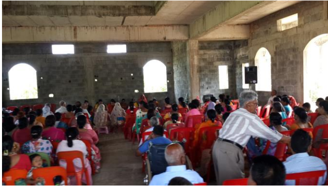
Figure 1: Doorga Pooja (Apr 2015)